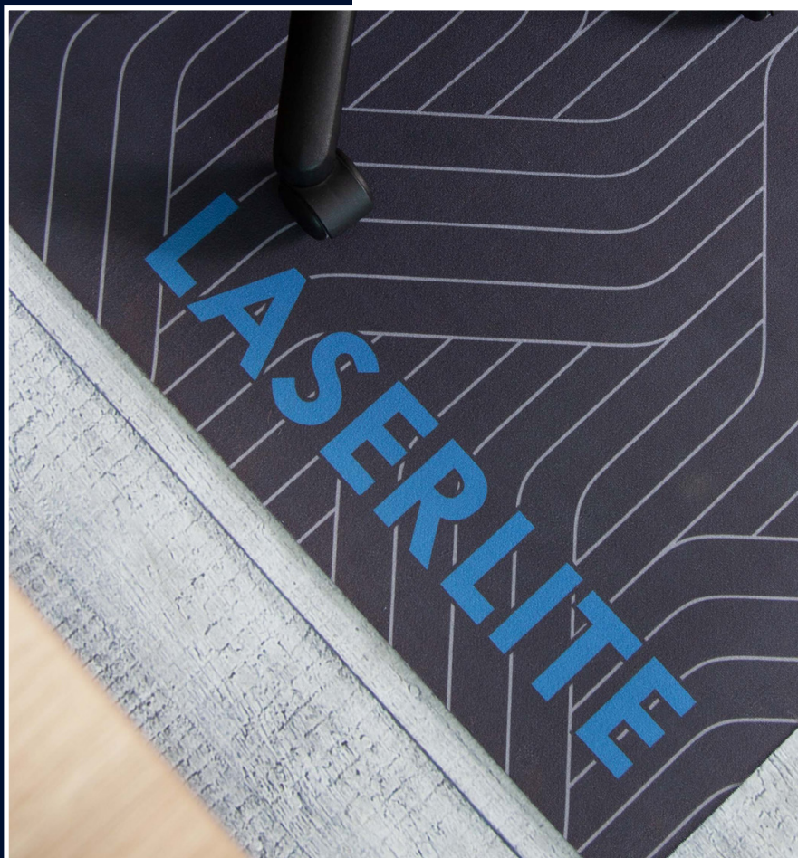
Product No. 32765