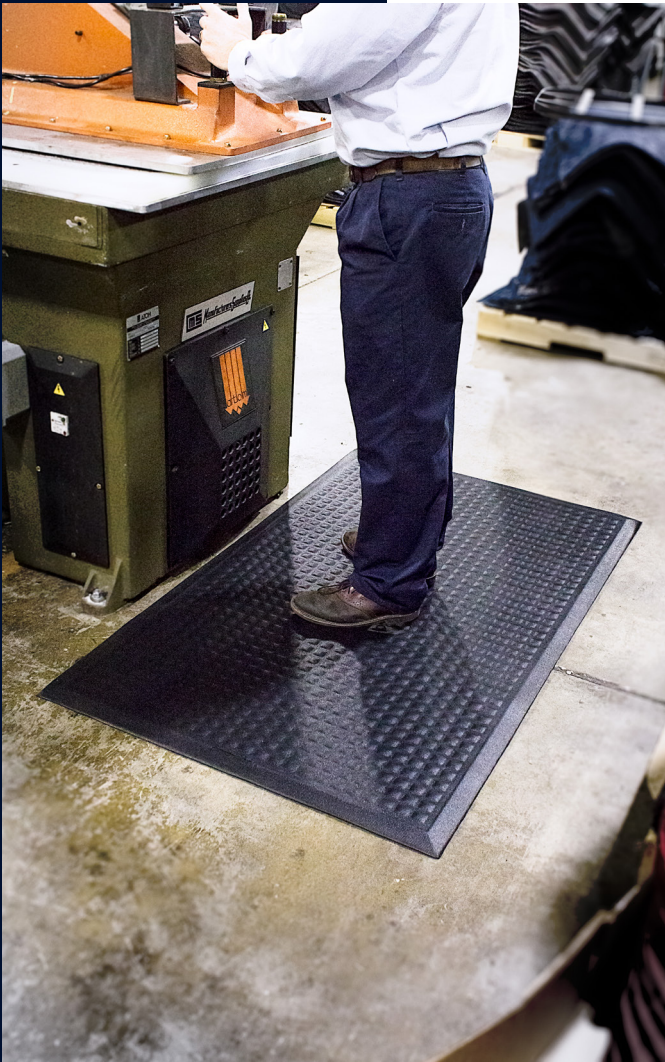
Standard Sizes (cm)