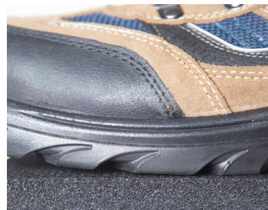
Thickness 13 mm