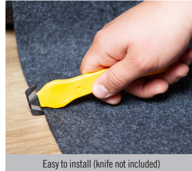
Easy to install (knife not included)