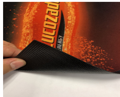
Anti slip backing