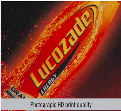
Photographic HD print quality