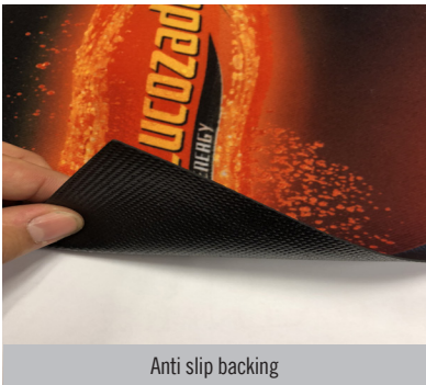
Anti slip backing