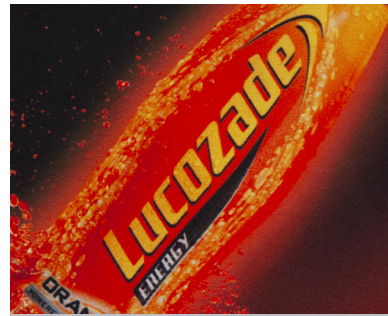
Photographic HD print quality