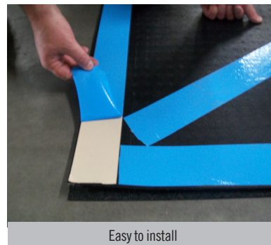
Easy to install