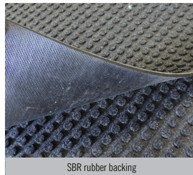
SBR rubber backing