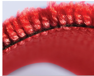
Made with 100% Recycled PET Carpet