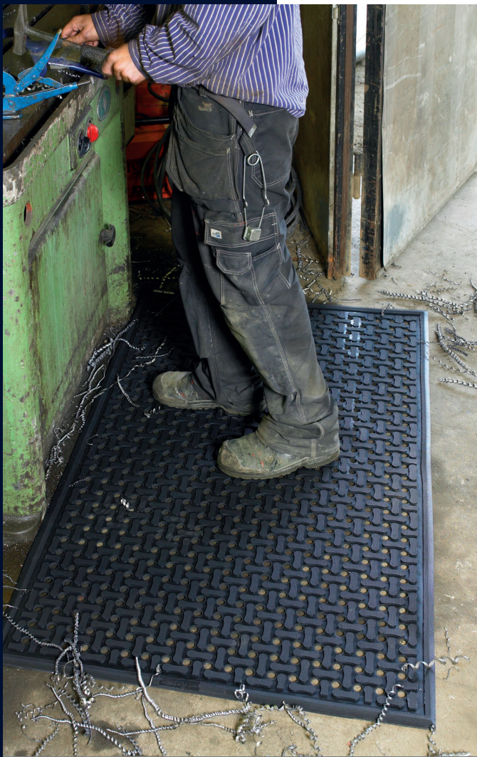
Standard Sizes (cm)