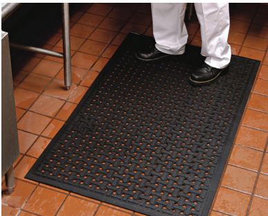
Ideal for wet applications