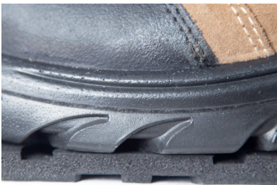
Thickness 9,5 mm