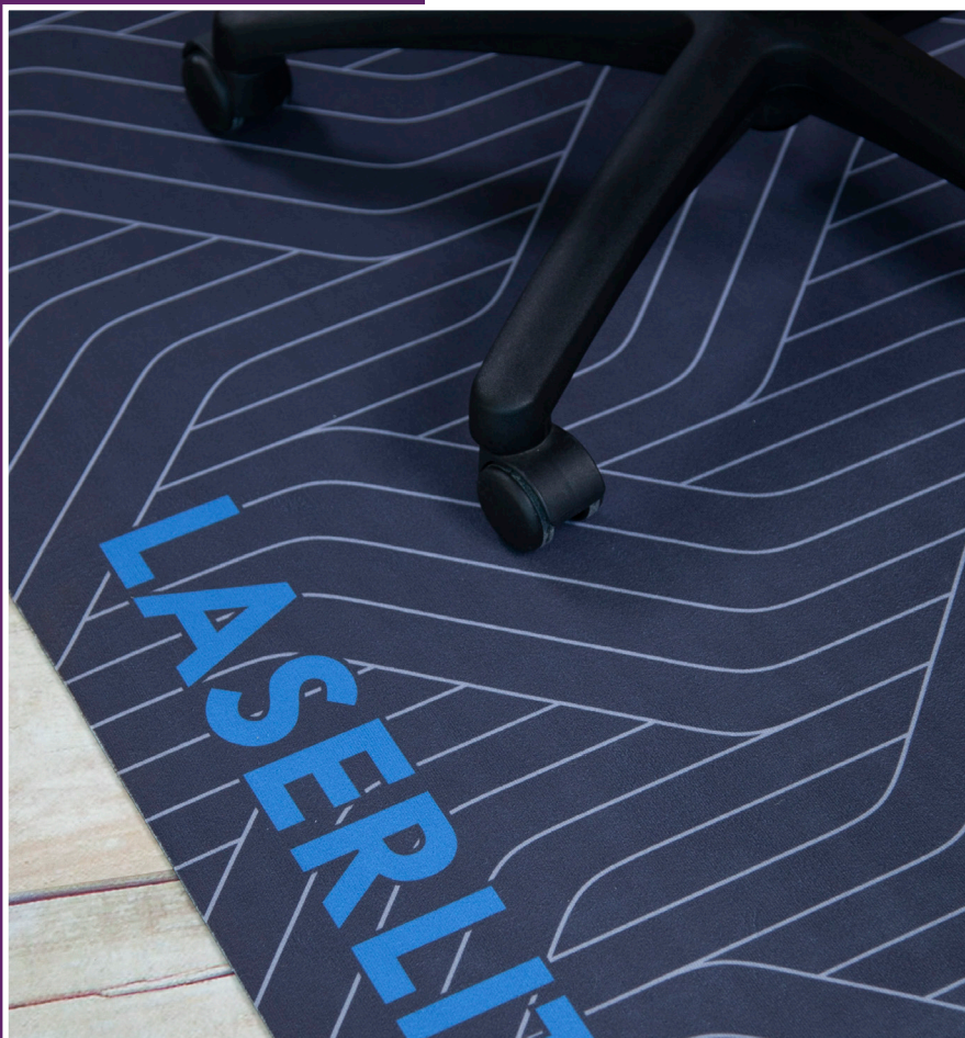
Product No. 32765